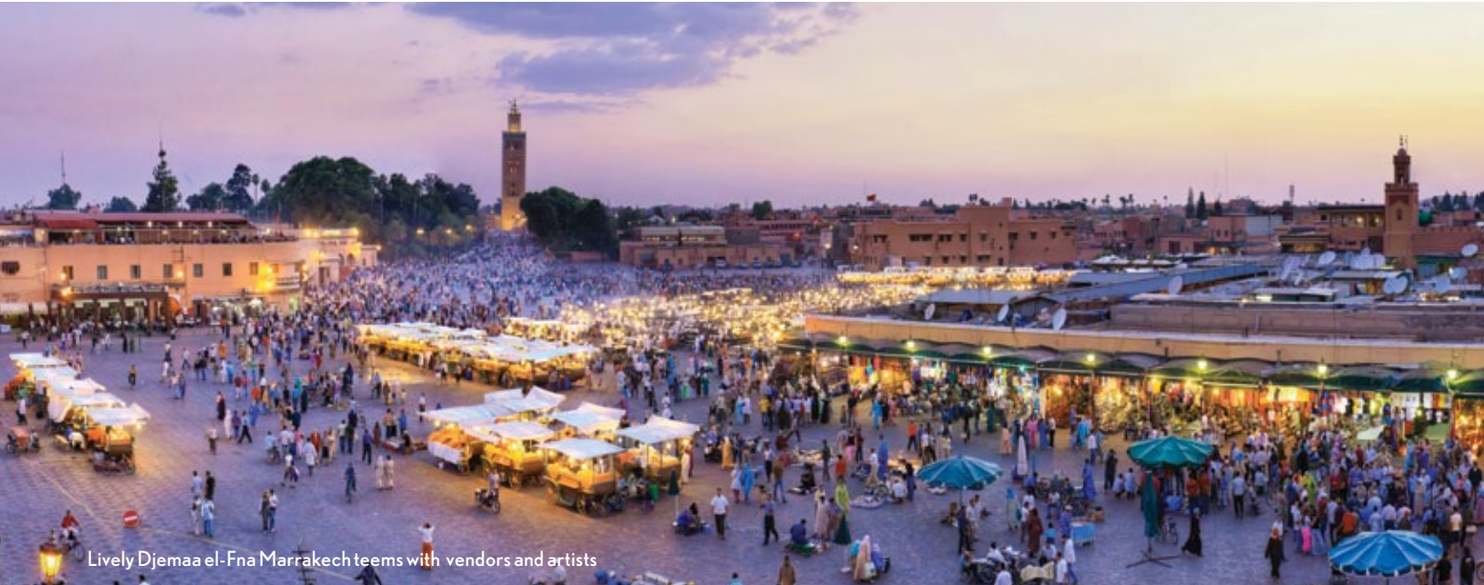
Lively Djemaa el-Fna Marrakech teems with vendors and artists