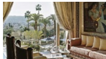
Sofitel Fès Palais Jamaï, Fez Outstanding Moorish and Arabic architecture sets this hotel apart.

Take a closer look at this journey’s inspiring accommodations.