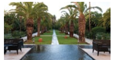
Sofitel Rabat Jardin des Roses Located in the heart of Rabat, near the mausoleum of Mohamed V.