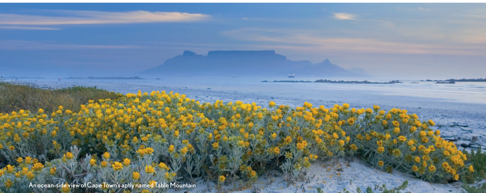
An ocean-side view of Cape Town's aptly named Table Mountain