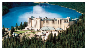
Fairmont Chateau Lake Louise Located at stunning Lake Louise, with premium rooms overlooking the water.

Take a closer look at this journey's inspiring accommodations.